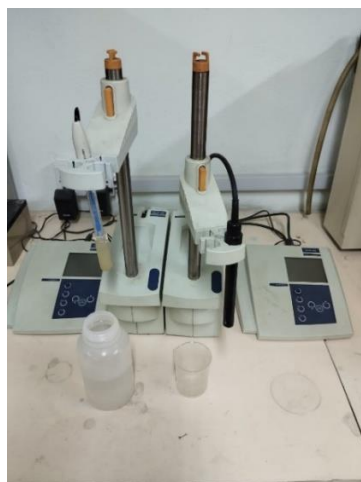
Electrical Conductivity & pH meter